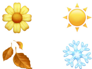
The Four Seasons